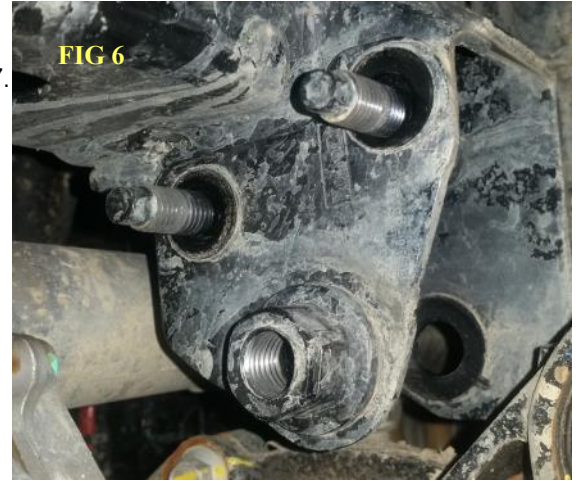
FIG 6. Ensure the diff is supported and undo the forward most front diff mount on passenger side, remove 2 nuts & main fixing bolt, knock the fixed nut from the bracket and retain for fitment. Allow the diff mount to be removed from the mount. move to fig 7.