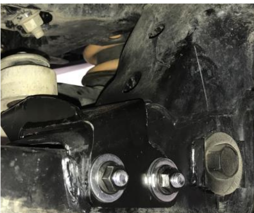
FIG 4&5. Fit bracket as shown in images using the 2 x M10x1.50P x 110mm long bolts with M10 Flange nuts and washers supplied. Reinstall factory bolt through diff mount into new bracket, fit supplied washer and flange nut, leave loose until the end of installation procedure.