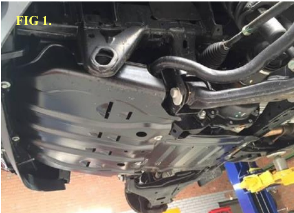
FIG1. Front factory bash plate to be removed—keep for refitting—modification will be required to refit..

This kit will lower diff by 26mm and moving diff forward 20mm thus reducing the angles CV Joints need to operate on and increasing clearances.