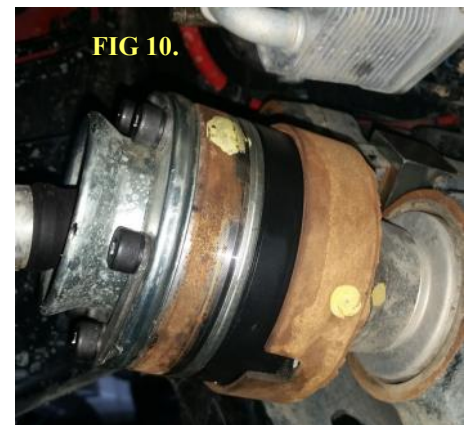
FIG 10.—Install Tail shaft spacer to front Tailshaft at Diff end, apply a small amount of thread lock to the new hex head bolts supplied.

Once all components have been installed in the prescribed order, tighten all bolts to recommended torque values, re-install the bash plates. Now you have lowered the front diff mount, the bash plates will require spacing. Spacers for Bash Plate relocation are not included in the kit.—spacer requirements are specific to Bash Plate brand and design.