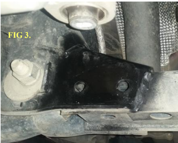
FIG 3. Once removed, clean the area with a flap disc and paint to avoid future corrosion.