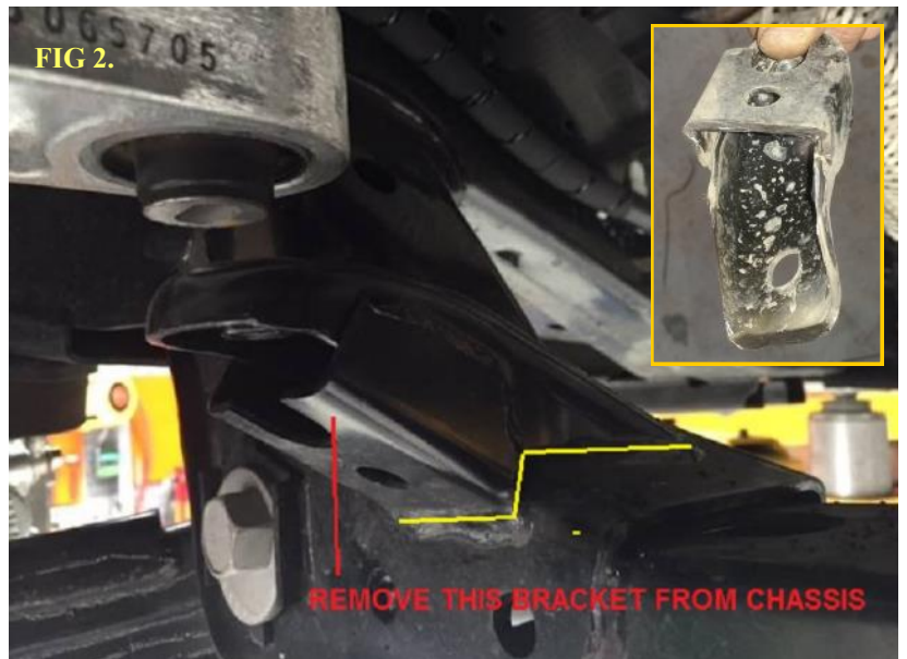
FIG 2. Drivers side rear mount needs to be removed, this will require small grinder and a thin cutting disc. →